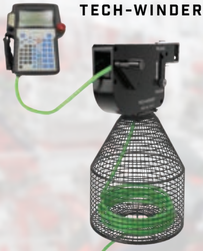
ROBOTIC CABLE WINDER