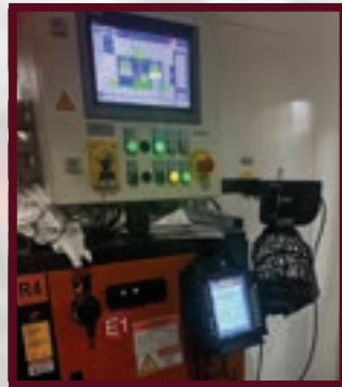
TECH-WINDER mounted on a robotic cell