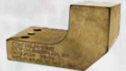
AMPCO 18 BRONZE