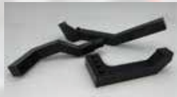
UNIQUE CUSTOM DETAIL