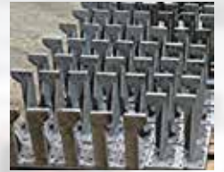
PRODUCTION RISERS AND BLADES