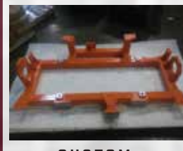
CUSTOM TOOL FRAMES