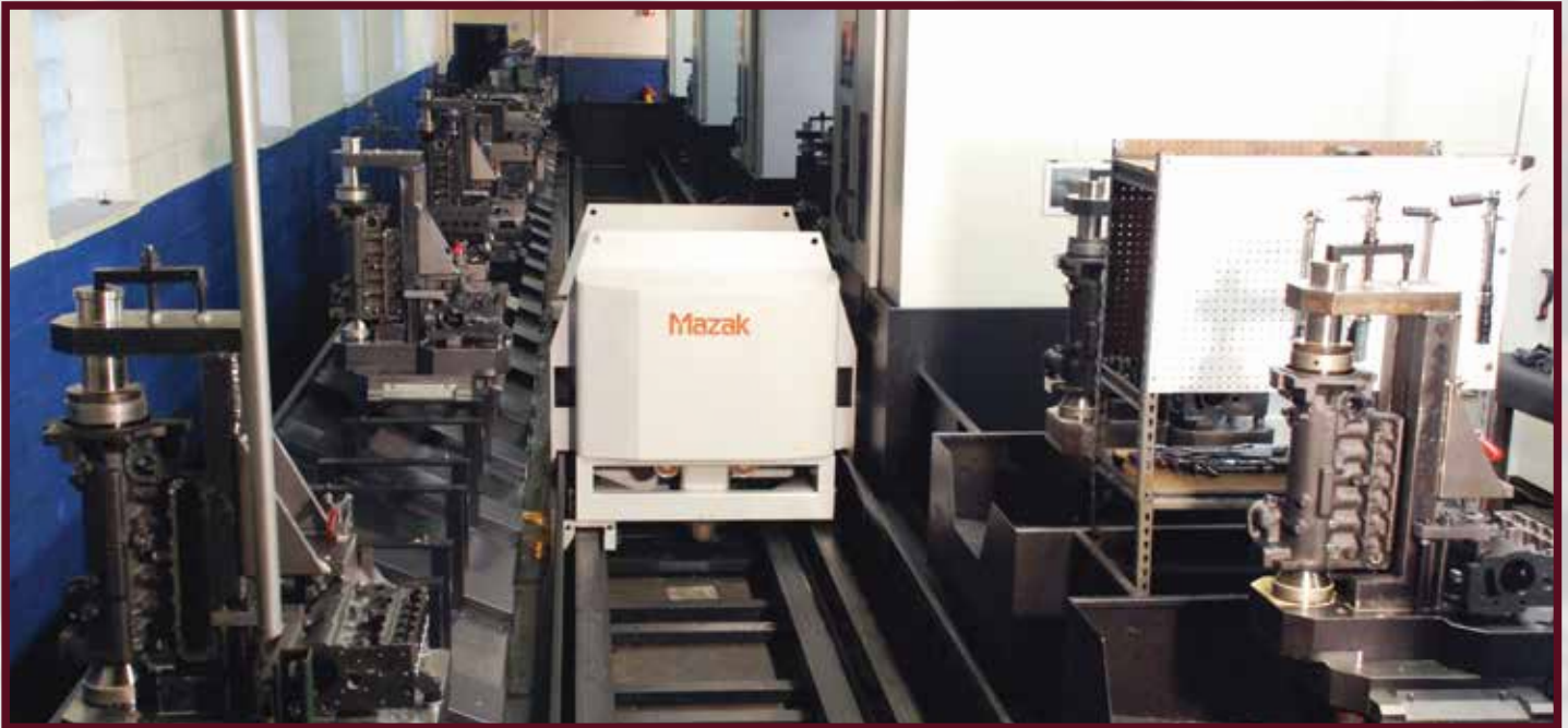
TECHRIM DETROIT- MACHINING CENTER

BY INVESTING IN OUR NEW MACHINING CENTER IN DETROIT, TECH RIM STANDARDS IS COMMITTED TO FASTER AND MORE EFFICIENT MANUFACTURING AND MACHINING PROCESSES